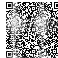
Salem English Lutheran