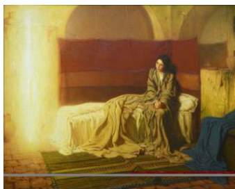
The Annunciation, by Henry Ossawa Tanner

The Annunciation of Mary December 7, 2025 Luke 1: 26-38