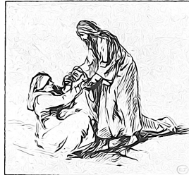
Healing Peter's Mother-in-Law, Rembrandt

First Christian Church (Disciples of Christ), Minneapolis, is a partner church at SpringHouse Ministry Center