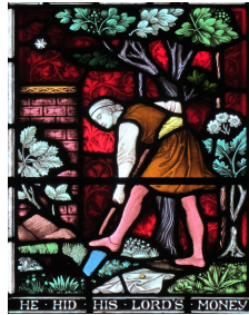
"He Hid His Lord's Money," stained glass in Corfe Castle, England

Revised Common Lectionary November 12, 2023 Parable of the Talent Matthew 23: 14-30