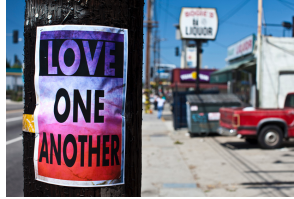
Los Angeles photo, 2011

Revised Common Lectionary October 29, 2023 The Greatest Commandment Matthew 22: 34-46