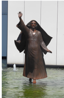
Sculpture at Crystal Cathedral, Garden Grove, CA

Revised Common Lectionary August 13, 2023 Jesus Walks on the Water Matthew 14: 22-33