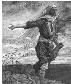
Sower by James Tissot

Revised Common Lectionary July 16, 2023 Parable of the Sower Matthew 13: 1-9