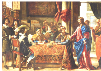
Vocation of St. Matthew, Juan de Pareja, Prado Museum

First Christian Church (Disciples of Christ), Minneapolis, is a partner church at SpringHouse Ministry Center