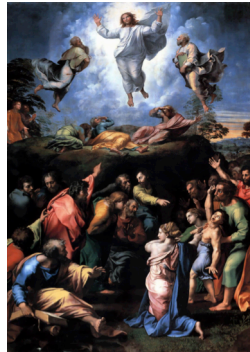
Transfiguration, by Raphael

First Christian Church (Disciples of Christ), Minneapolis, is a partner church at SpringHouse Ministry Center