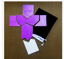
GP400-Mystery of Easter

Children's Ministry Team. We meet the first Sunday of the month at noon in the Sunday school space. Next meeting will be Sunday, March 3rd.