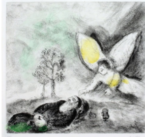
Elijah Touched by an Angel

First Christian Church (Disciples of Christ), Minneapolis, is a partner church at SpringHouse Ministry Center