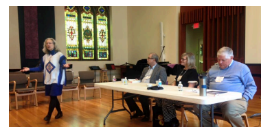
Final panel discussion