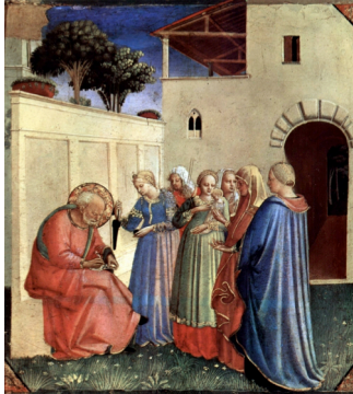
Naming of John the Baptist, Fra Angelico