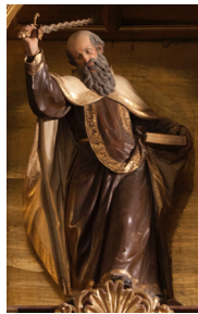
Statue of Elijah in Avila, Spain

First Christian Church (Disciples of Christ), Minneapolis, is a partner church at SpringHouse Ministry Center