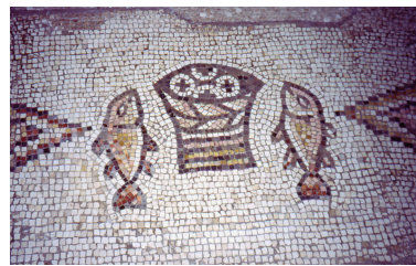
Mosaic at the Church of the Loaves and Fishes, Tabgha, Israel

Preaching Text "God's Math" for Sunday, October 27 Matthew 14: 13-21