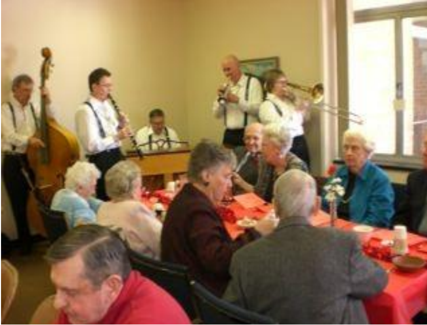
The Mouldy Figs entertained at the Anniversary Dinner on Feb. 22, after providing the music for the Fat Sunday Worship.