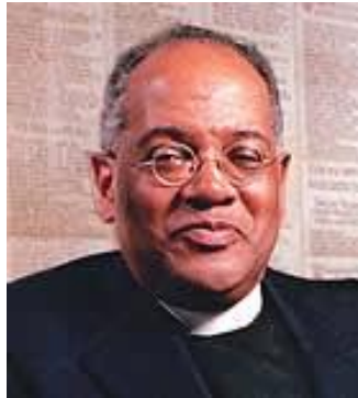
Rev. Peter J. Gomes called "How to Keep a Good Lent."